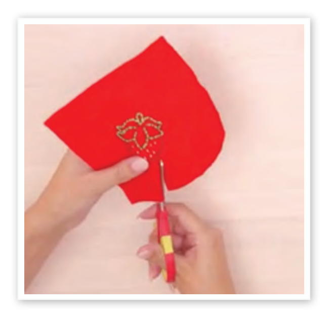
Step 1: Once finished, take it out of the hoop and cut around your stitching leaving a 1 - 2cm border around the design.