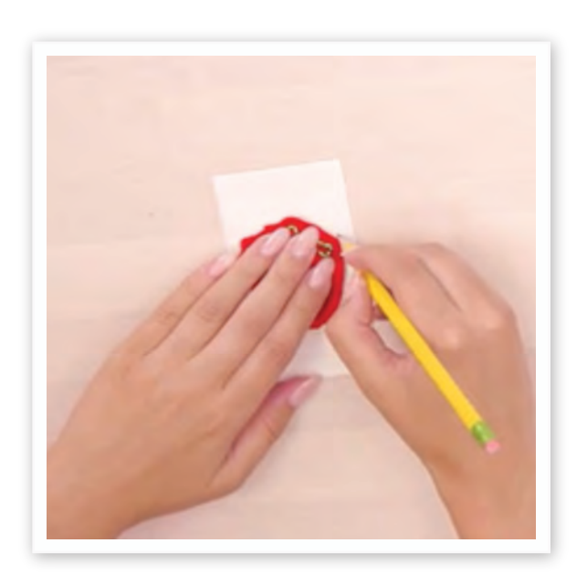
Step 2: Trace your cut-out embroidered design on the peel-and-stick fabric fuse sheet (on the smooth side). Cut out the traced shape.