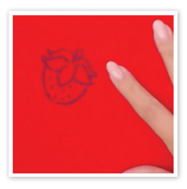
Step 3: Thread needle using an arms-length of embroidery floss (use tapestry needles for little kids). Knot the end.