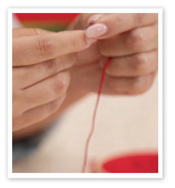
Step 3: Thread needle using an arms-length of embroidery floss (use tapestry needles for little kids). Knot the end.