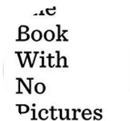
The Book With No Pictures B.J. Novak